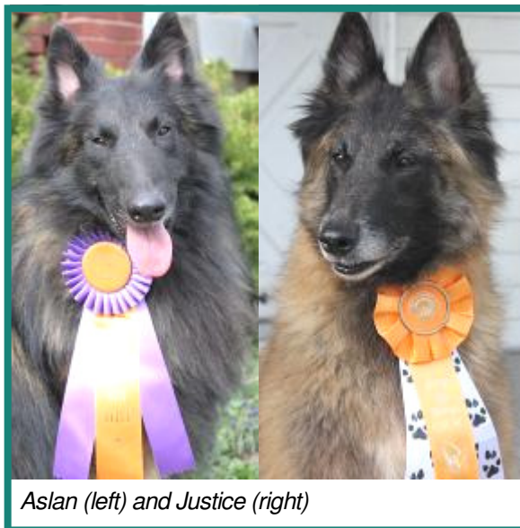
Aslan (left) and Justice (right)